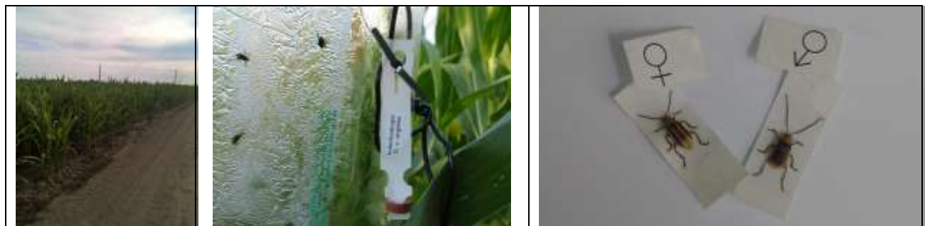
Figure 1 Methodological aspects: a) experimental plots (left); pheromone traps (Csalomon® type) (center); identification of sex-ratio/male and female of Diabrotica virgifera (right)