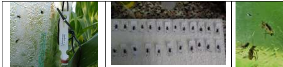
Figure 2 Adults Diabrotica captures on traps in different hybrids of corn: beetles caught on pheromone trap (Csalomon® type) (left); males and females collected from a trap (center); beetles on detail (right)

T 1 T 2 T 3 , pheromone traps (Csalomon® type)