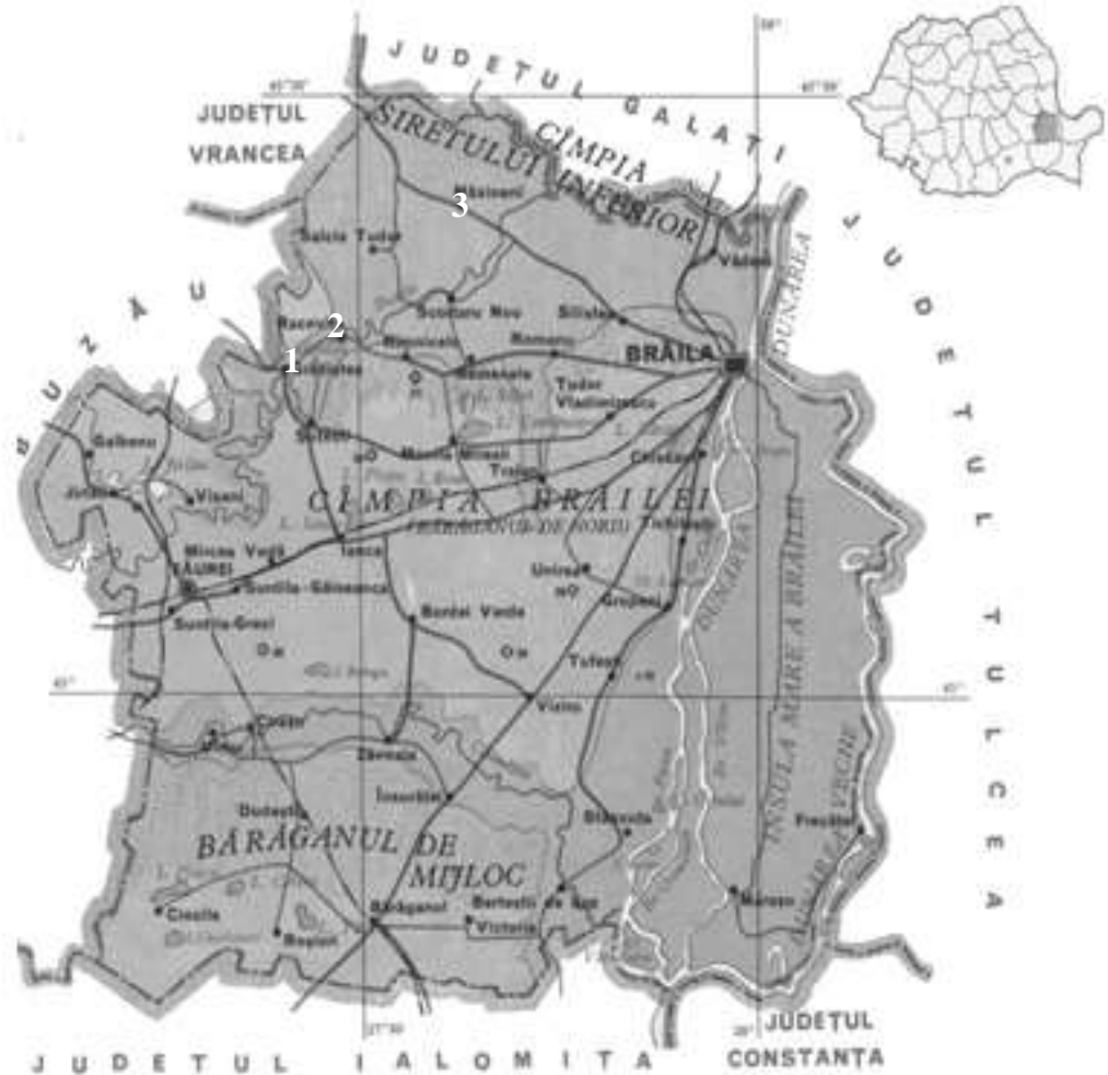
Figure 4 The geographic position of the Gradiștea - 1, Racovița – 2, and Măxineni - 3 villages on the map of Brăila county where the attack of the Albugo tragopogonis fungus has been observed. The geographic position of Brăila county on the map of Romania