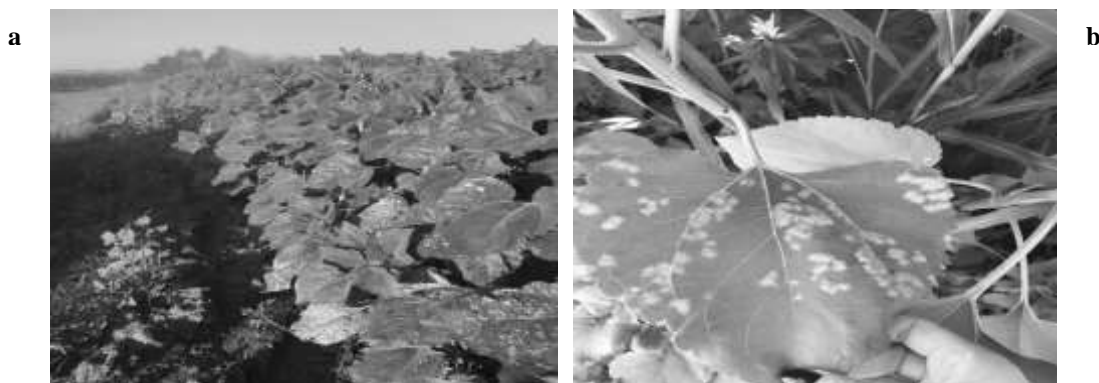
Figure 2 Attack of Albugo tragopogonis fungus at the sunflower: a – plants attacked in Grădiștea locality, Brăila county, b - plants attacked in Racovița locality, Brăila county (original)