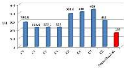
Fig.1. Alkaline phosphatase values