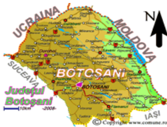
Figure 1 Administrative-territorial location of Botosani county

county has a high potential of human resources that can provide the necessary labor in agriculture.