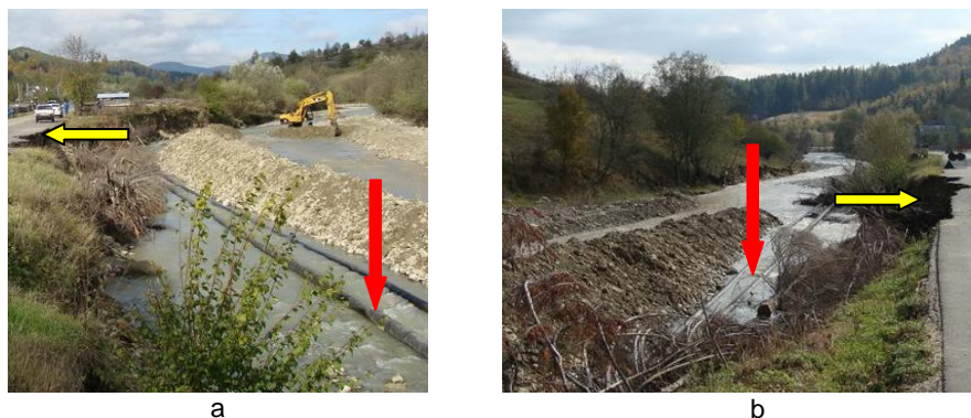
Fig. 3 The degradation of the oil transport pipelines in the Bolătău area after the flood in June 2016 on the Tazlăul Salat River: a - upward view of the pipeline position; b - downstream view (shoreline at DC180A with pipe stripping, photo oct 2016).

The research carried out in the area of Bolătău locality, Zemeș commune, in the Tazlăul Sărat riverbed and in the riparian area, revealed the way of the floods in the river degradation. In this area, the river features a meandering bed, and at the contact with the DC 180A communal road a short length of defence was executed.