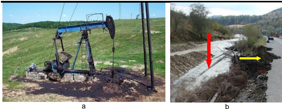
Fig. 2 Sources of soil and water pollution in the Tazlăul Salat river basin: a - oil extraction wells; b - pipelines for the transport of technological products (photo oct 2016).

- the anthropic risk represented by the action of the constructions and the oil exploitation installations in the Zemeș - Moinești area;