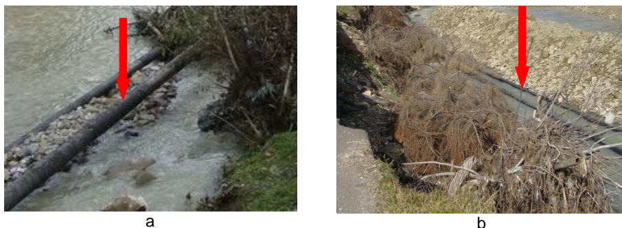
Fig. 4 Details on the dismantling and suspension of oil pipelines located on the DC 180A limit and on the Tazlăul Sărat river bank, in the area of Bolătău locality, after the flood of June 2016: a - details on the state of the pipelines; b - pipeline movement (photo Oct 2016).

Oil pipelines and technological fluids (eg reservoir water) are located on the bank of the river. The erosion of the bank at floods, as well as the flow with medium flow in the bedrock, led to the pipe stripping, suspension and corrosion under the influence of climatic factors (fig. 4). Field analysis did not reveal the presence of shoreline protection along the length of the road.